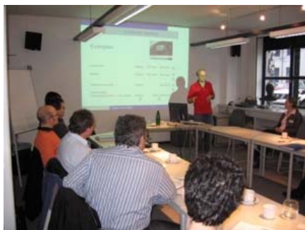
Seminar „Hands-free to VDA specification“

The trainings will take place in the perfectly equipped HEAD Training Center at our headquarters in Herzogenrath, Germany. They will be held either in German or in English. It is also possible to hold the trainings at the customers site if there are enough participants. In case of interest please send an email indicating the number of participants and their knowledge level to telecom@head-acoustics.de .