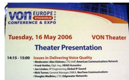
HEAD acoustics presentation on voice quality issues during VON Europe 2006

A fourth event with HEAD acoustics Telecom participation, CommunicAsia 2007, will take place from June 19-22, 2007, at Singapore Expo, where HEAD acoustics will be represented by its local sales partner TME Systems (booth 3A3-10).