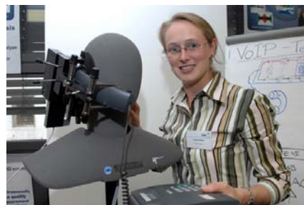
"Live Tests" during VoIP Germany 2006

While the exhibition part was predominant at VON Europe, VoIP.Germany, organized by DVPT (German Association for Post and Telecommunication) as well as the Frankfurt Chamber of Commerce entrusted HEAD acoustics with carrying out on-site "Live Tests". For this purpose the analysis system ACQUA was used to run a specified set of voice quality tests for selected VoIP products shown by exhibitors. The test results contributed to the "VoIP Award" given to the three best products. They were summarized in individual reports handed out to the participants after the event. The reports revealed to them the quality position of their products in an anonymous comparison and provided important hints on how to optimize the voice quality of their products.