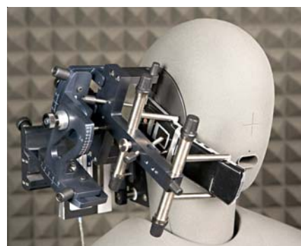
Prototype HHP III

HHP III now fulfills all requirements with regard to the "Recommended Test Position" (RTP) specified by IEEE 269 as well as the latest draft of ITU-T recommendation P.64. For example, measurements