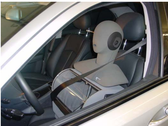
Speech quality tests of car hands-free systems with HMS II.3

HEAD acoustics GmbH Ebertstraße 30a D-52134 Herzogenrath Tel: +49 (0) 2407-577-0 Fax: +49 (0) 2407-577-99 E-mail: telecom@head-acoustics.de WEB: www.head-acoustics.de