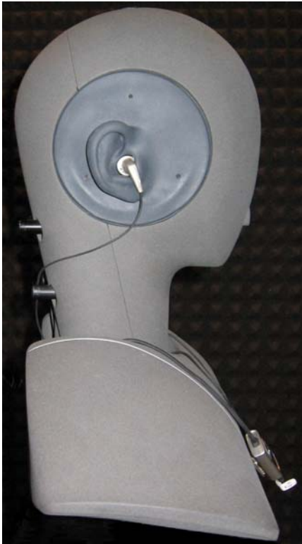
Intra-concha headset in anatomically shaped pinna (type 3.3) of artificial head HMS II.3