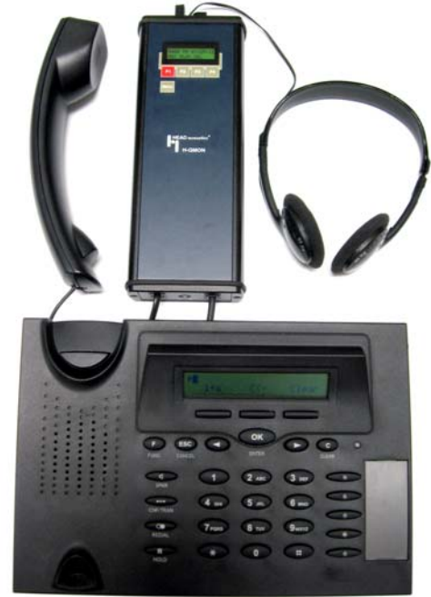
H-QMON connected to IP phone, handset and headphone